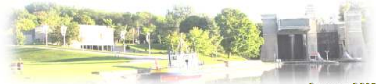
Pictured: Trent/Severn Lift Lock, Peterborough ON